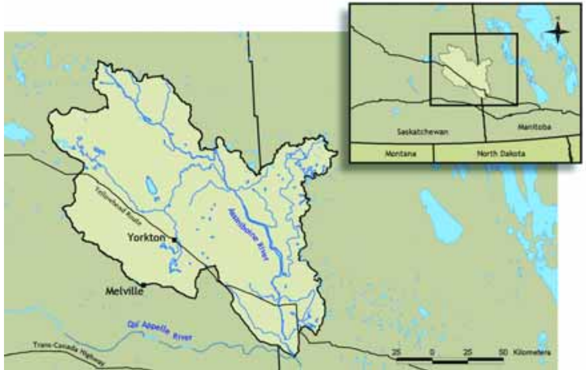
Upper Assiniboine River Basin

increases in livestock numbers and density may begin to have a bigger effect on water quality. As indicated in the Lower Fraser Valley case study, increasing livestock densities may lead to excessive nitrates and other compounds contaminating water supplies, further increasing the benefits of converting land to wetlands and other natural areas.