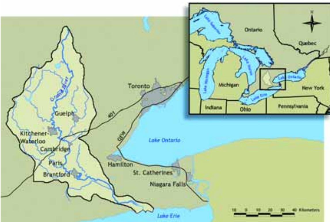
Grand River Watershed

Sediment from soil erosion also becomes deposited in roadside ditches and other conveyance structures and reduces the capacity of reservoirs and storage facilities within the watershed. This impact can reduce the effectiveness of these structures and increase the likelihood of flood events.